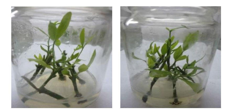
Fig. 3. Proliferation of jojoba nodal segments after six weeks cultured on MS media supplemented with 3.0 BA + 2.0 TDZ