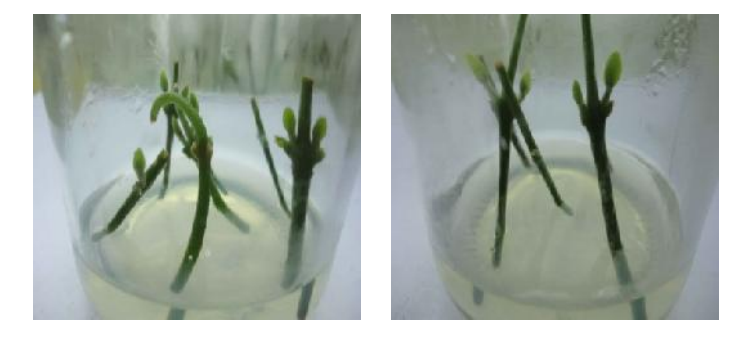
Fig. 2. Proliferation of jojoba nodal segments after two weeks cultured on MS media supplemented with 2.0 BA + 0.5 NAA