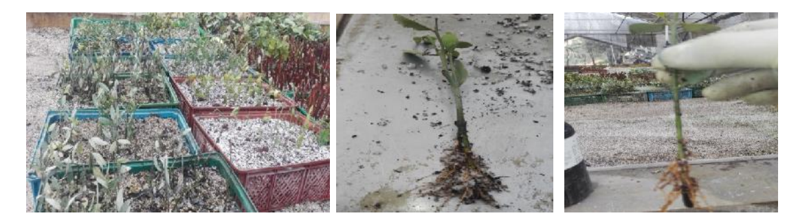
Fig. 4. Vegetative propagation of jojoba via semi hard stem cuttings in medium comprising peat moss, perlite and vermiculite