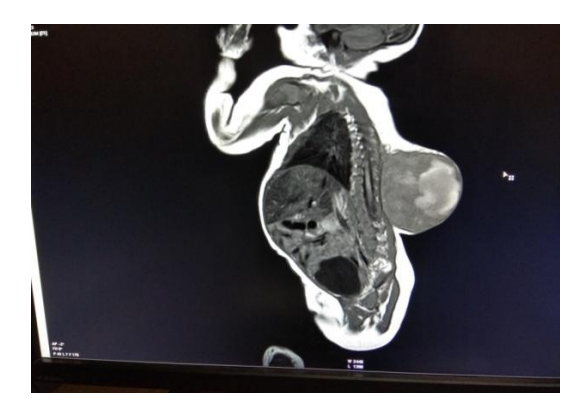
Fig. 2. MRI showing a paravertebral lesion non communicating with spinal cord