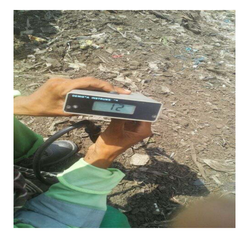
Fig. 3. Measurement of oxygen % by OT meter

There is inverse relationship observed between oxygen and temperature, as the amount of oxygen reduces when temperature of the windrow increases [8]. The decline in oxygen percentage was observed (Fig. 1). The sufficient amount of oxygen is very important in aerobic composting as it only contains aerobic bacteria [9]. Proper turning of windrow is important to provide aeration. Ghao et al. [10] reported that large amount of oxygen at the start of composting must be necessary and it can be achieved by proper turning. The different inoculums did not affect the percentage of oxygen. There was not much variation observed when windrows having different inoculums were compared.