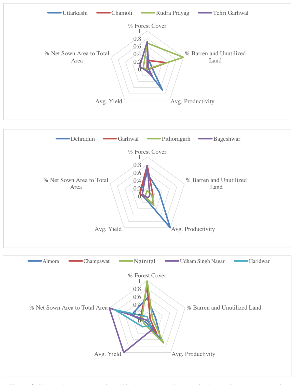
Fig. 2. Spider web representation of index values of ecological security and economic efficiency variables for districts of Uttarakhand

Kumar and Irfan; AJOGER, 1(3): 185-192, 2018; Article no.AJOGER.45993