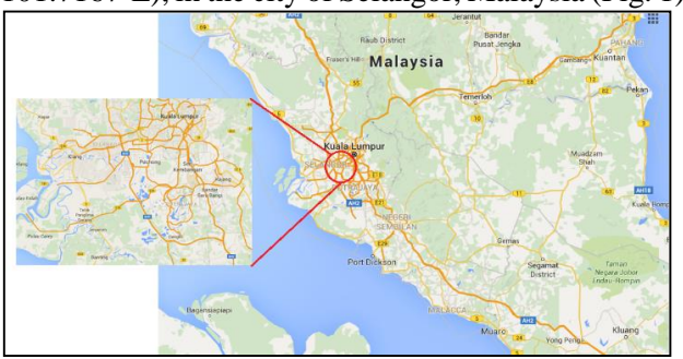
Fig. 1: Map of sampling location for chicken slaughterhouse wastewater

Raw undiluted wastewater sample was collected twice weekly for six weeks 26<sup>th</sup> October 2015 – 7<sup>th</sup> December 2015 from a local chicken slaughterhouse located in a suburb area (GPS coordinate: 3.0333°N, 101.7167°E), in the city of Selangor, Malaysia (Fig. 1).