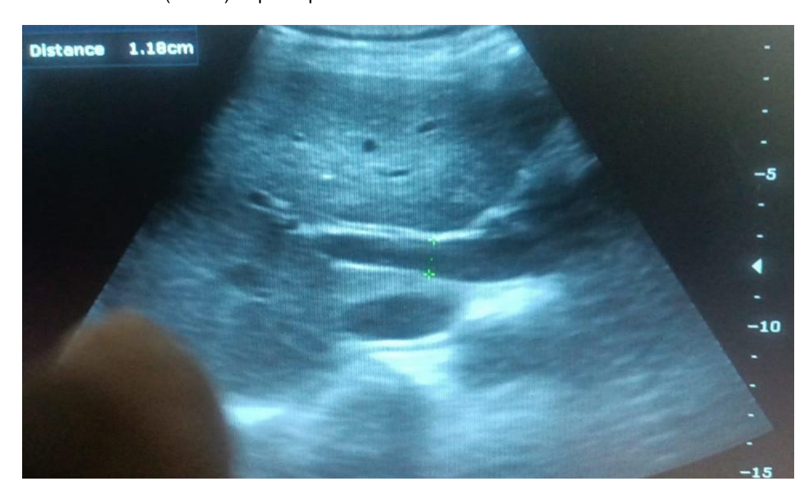
Fig. 1. Longitudinal view of the abdomen showing the levels of measurement of the portal vein (green dotted lines)

Portal vein diameter ranged from 6.8 mm to 16.6 mm, with a mean of 10.46 \pm 2.00 mm (Fig. 2). Body mass index (r = 0.41), age (r = 0.43), parity (r = 0.44), and weight (r = 0.49), had a fairly strong, significant relationship (p - 0.001) with portal vein diameter. Height also had a significant statistically (although weak) relationship with portal vein diameter (r = 0.27; p - 0.001) (Table 2). The relationship between vein diameter portal and age/parity of participants was of positive increasing trend. There was a gradual increase in the portal vein diameter of participants 15 years to greater than 40 years. The difference in the mean portal vein diameter between the age groups was significant (f-stat = 22.11; p - 0.001). A similar trend was seen with parity (Table 3). Results for the intraobserver and interobserver correlation coefficients are shown in Table 4. Table 5 shows results of normal mean portal vein diameter observed by previous studies across the globe.