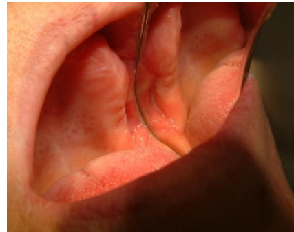
Fig. 4. Leukocyte-rich inflammatory infiltration with acellular lacunae (H&E, x400)