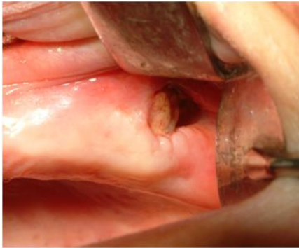
Fig. 1. Clinical view of the exposed necrotic bone and surrounding soft tissue