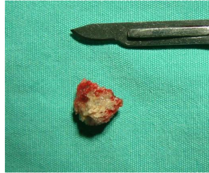
Fig. 2. View of removed sequestrum