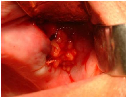
Fig. 3. Intraoperative photograph illustrating the defect closure with pedicled buccal fat pad flap