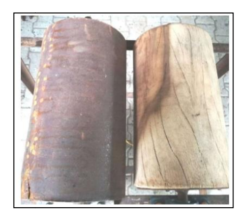
Fig. 2. Threshing mechanism-drive (Wood) and driven (Iron) rollers