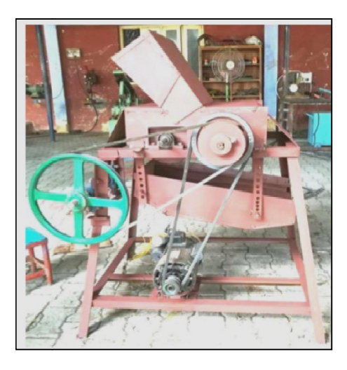
Fig. 3. Power operated portable sesame thresher