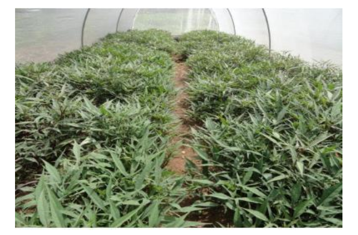
Fig. 1. Tunnel of multiplication of cuttings of sweet potato